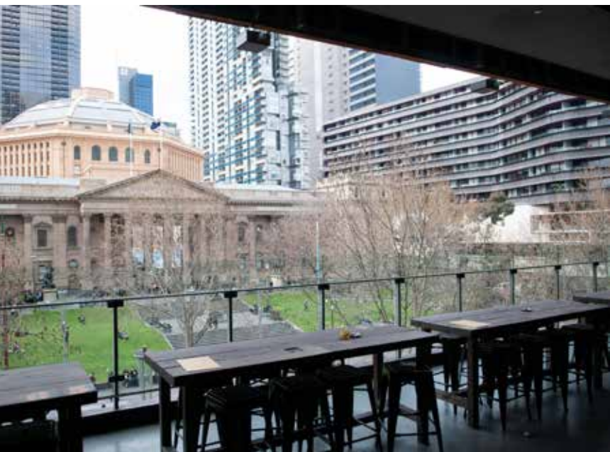
Our bar and drinking area overlooks the Swanston Street State Library.