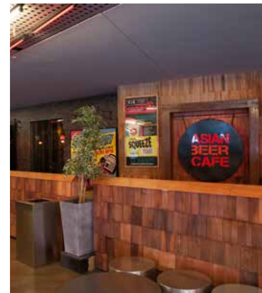
This space, located just outside of our entrance, is perfect for large meal bookings for corporate or celebration dinners. The area can seat up to 40 seated guests, or up to 80 guests with a seated and standing mixture.